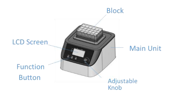
Fig.3 Thermo Control