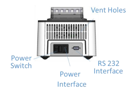
Fig.4 Interface & Power Switch