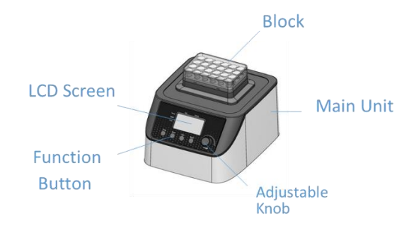
Fig.2 Thermo Mix