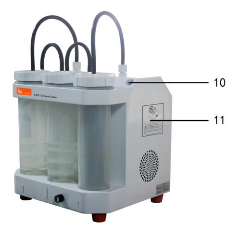
10. Power switch 11. Pipeline connection Instruction

Air inlet Air outlet Washing tank Neutralization tank Drying tank Fast coupling Flowmeter value Pipe Joint Connecting Pipe