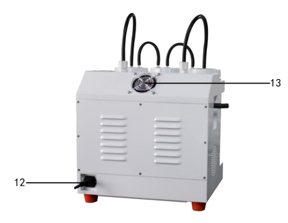
12. Power socket 13. Cooling Fan